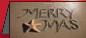
CJDL1 - DL Design 1