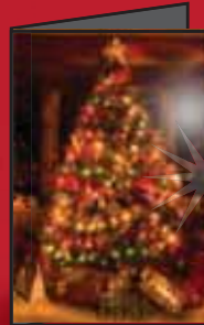
CJPC6 - Postcard Design 6