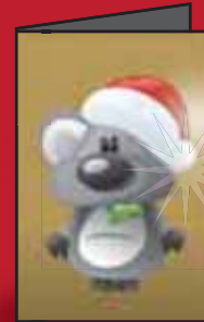
CJPC7 - Postcard Design 7