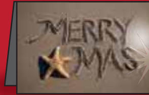
CJPC3 - Postcard Design 3