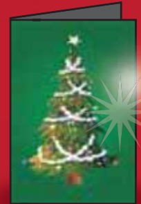
CJPC8 - Postcard Design 8