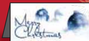
CJDL6 - DL Design 6

Plain unprinted envelopes supplied FREE with your order. DL or C6 size to suit the size of your cards.