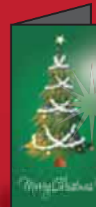
CJDL5 - DL Design 5