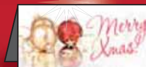
CJDL7 - DL Design 7