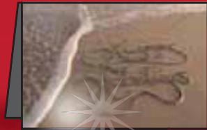
CJPC2 - Postcard Design 2