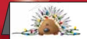
CJDL3 - DL Design 3