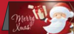
CJDL4 - DL Design 4