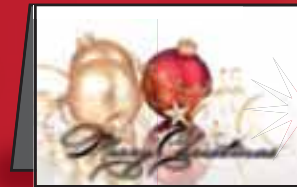
CJPC5 - Postcard Design 5