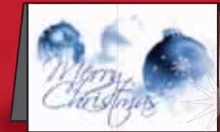
CJPC4 - Postcard Design 4